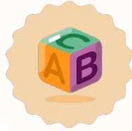
EDUCATIONAL AND CHILD CARE SERVICES