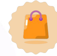
RETAIL AND WHOLESALE STORES