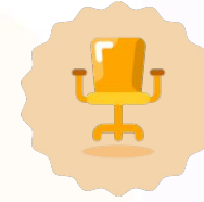
OFFICE AND ADMINISTRATIVE