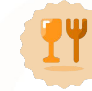
RESTAURANTS AND BARS

More details on these class codes are available at pieinsurance.com/agency/target-classes