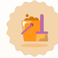
JANITORIAL AND CLEANING