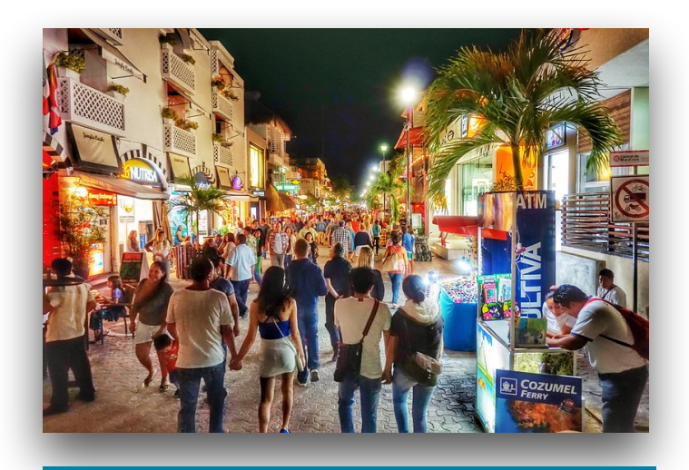
Shopping Trip to Playa del Carmen's 5th Ave