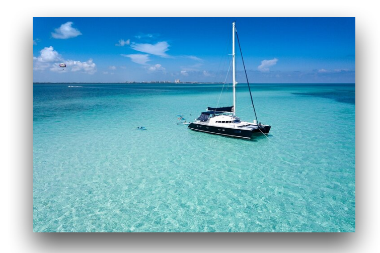
Catamaran Secret Sandbar Sail with Lunch and Drinks

But really, this vacation is all about your "License to Chill"