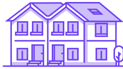
2-4 Unit buildings